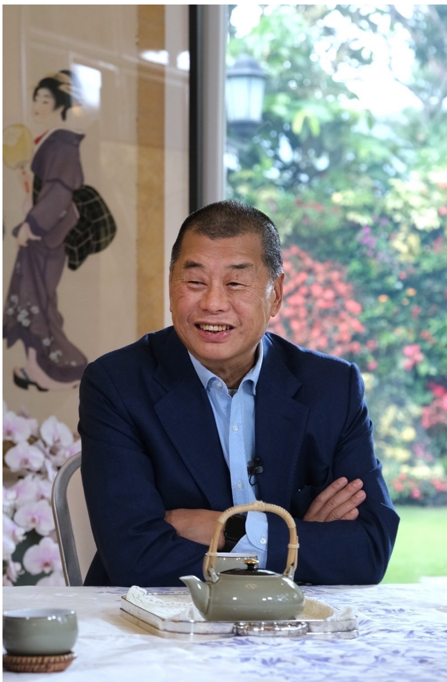
Jimmy Lai.